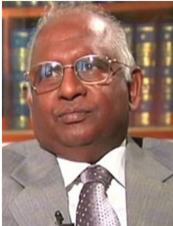
Dr. K. G. Balakrishnan

Former Chief Justice Supreme Court of India