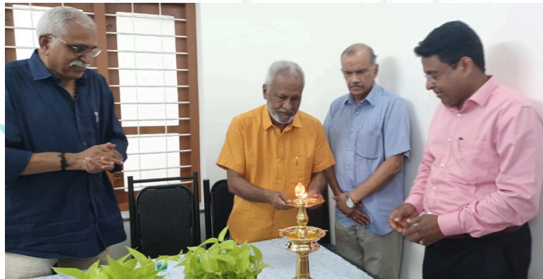
Inauguration of CG3 Thiruvananthapuram Office Premises

CG3 is on the road to “Mission Mediation” and to further this concept we have taken an initiative to setup a Mediation Centre. With a strength of 26 mediators of which 24 mediators were trained with CG3 under the aegis of Mediation and Conciliation Project Committee of Supreme Court of India we have a full fledged mediation centre and each mediator is equipped to handle various mediation matters irrespective of whether it is family matter, corporate matter, societal issue and so on.